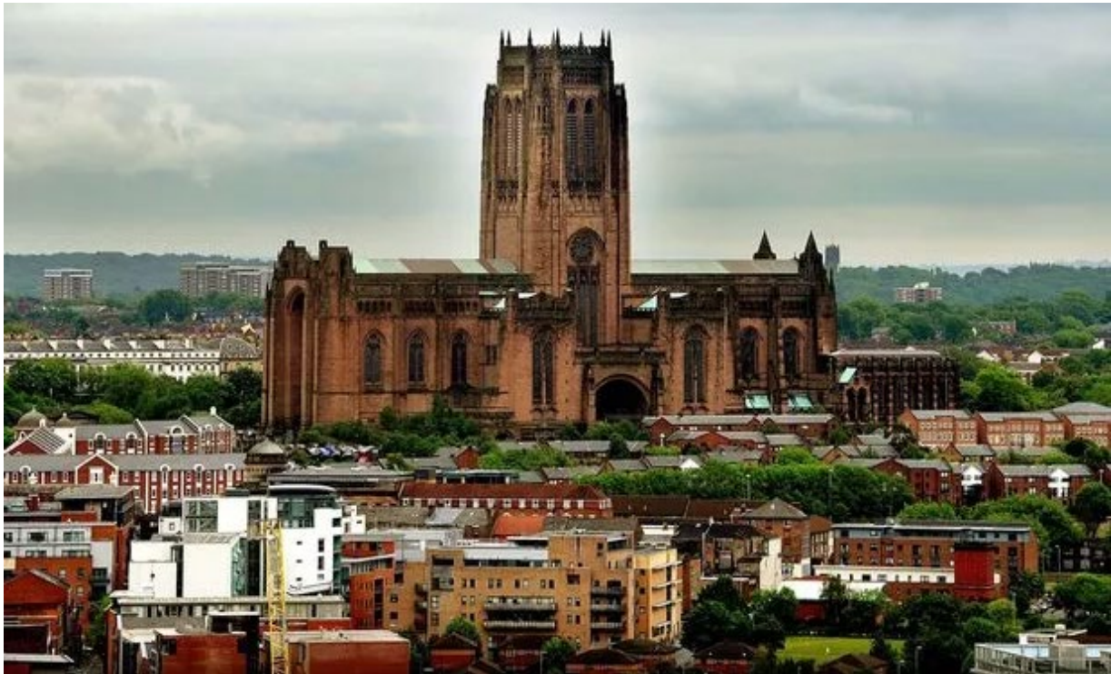
Figure 2: View of Liverpool Cathedral and surrounding areas from Jamaica Street. https://thesecret.app/secrets/3291/jamaica-street-view-of-liverpool-catherdra/ (acc. 21 September 2024)

This context underscores the societal impact of Liverpool Cathedral's music outreach activities. By offering educational opportunities, artistic engagement and community building through music, the Cathedral's music programme provides critical support to children and families facing social and economic challenges. In such a deprived environment, the Cathedral's outreach plays an essential role in enriching lives and fostering resilience across the Liverpool City region.